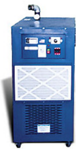
Dryer Model MD 100 Shown